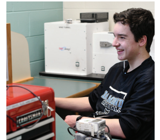
Rockford Education Foundation Reporting Fiscal Year July 1, 2017 – June 30, 2018